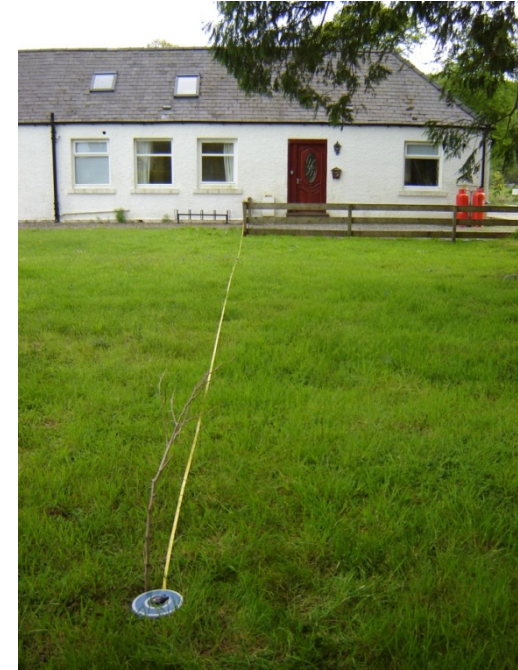
Photograph to right indicates position of south facing elevation of proposed dwellinghouse in close proximity to unit 2 Ballochyle Farmhouse.