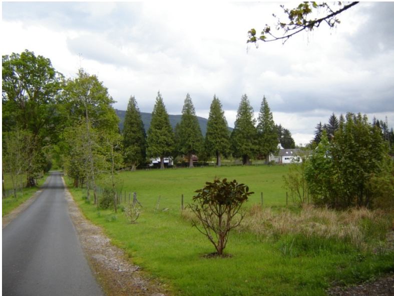
Photograph s indicate the low density and rural setting of Ballochyle Farmhouse to the right and 1 Ballochyle to the left of the appeal site. Photographs also indicate the landscape feature of the avenue of Western Red Cedars. Farmhouse.